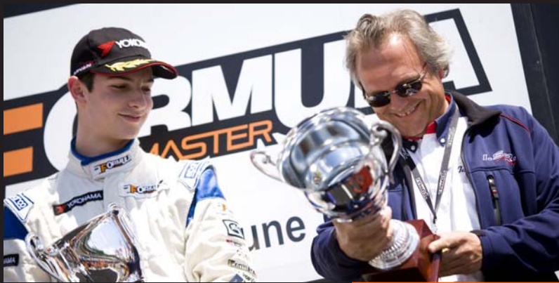
ISR wins first IFM victory