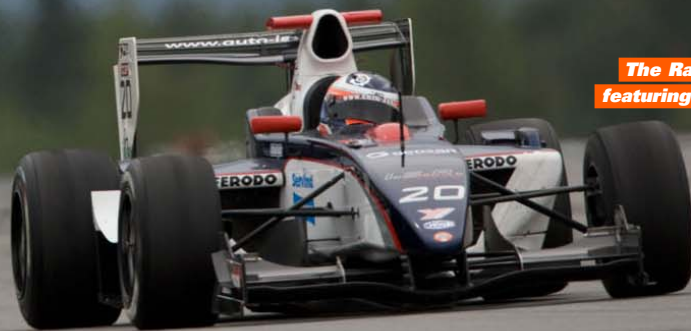
The Race... featuring IFM