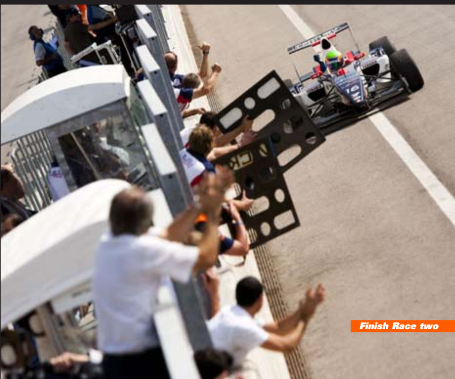
Finish Race two