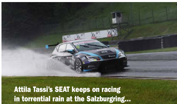
Attila Tassi's SEAT keeps on racing in torrential rain at the Salzburgring...