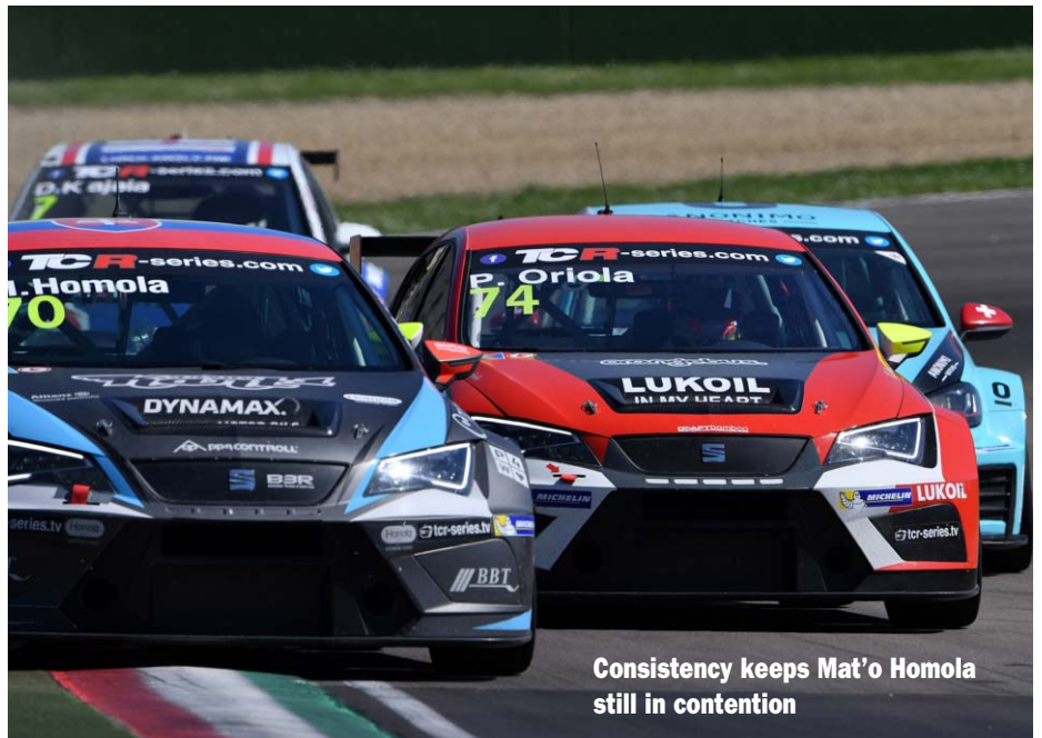
Consistency keeps Mat'o Homola still in contention