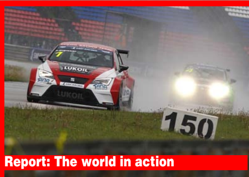
Report: The world in action