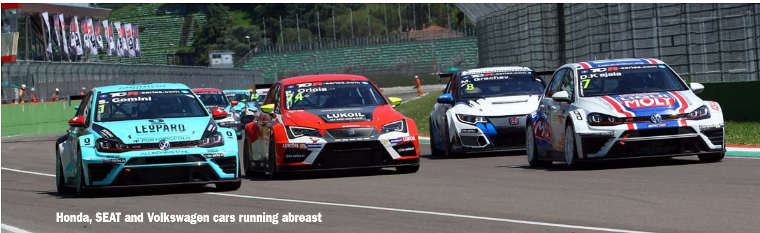
Honda, SEAT and Volkswagen cars running abreast