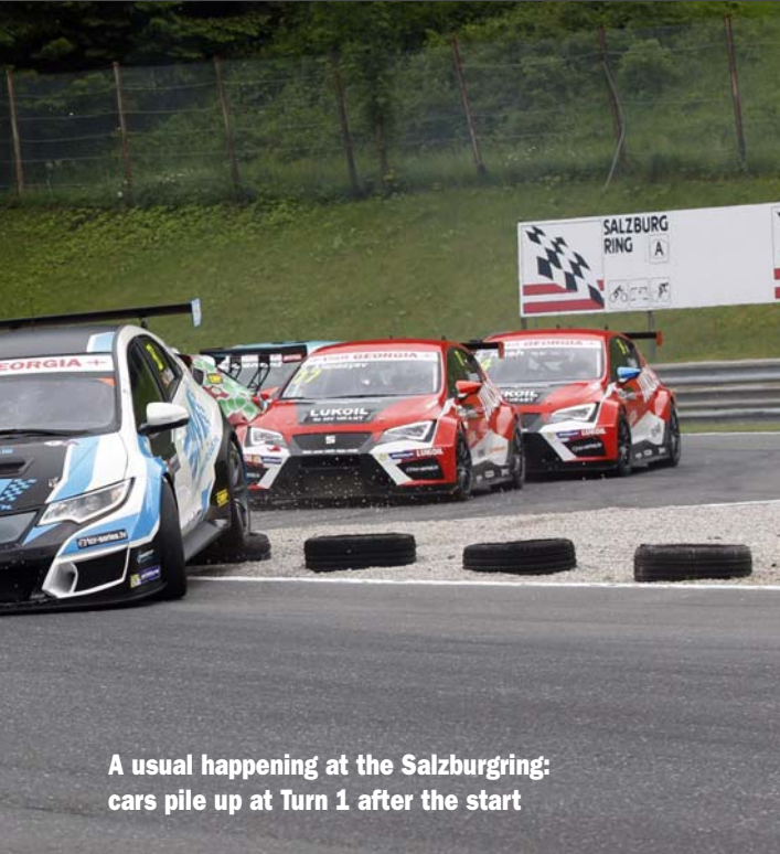
A usual happening at the Salzburgring: cars pile up at Turn 1 after the start