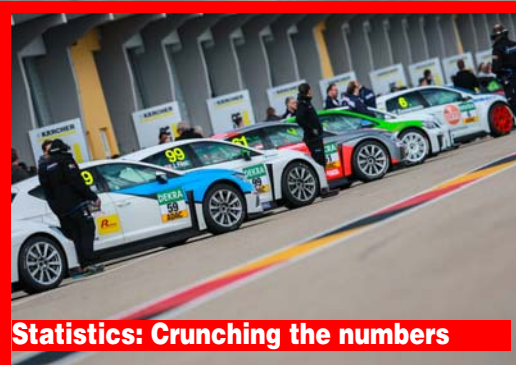
Statistics: Crunching the numbers