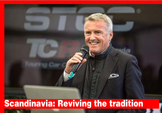
Scandinavia: Reviving the tradition