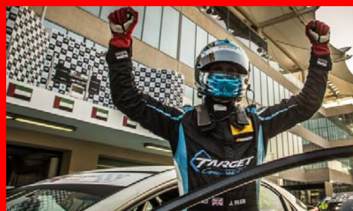
Middle East: Files champion