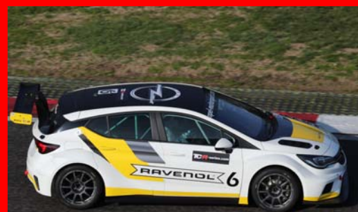
International Series: preview