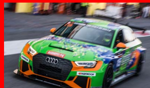
Endurance: Audi wins twice