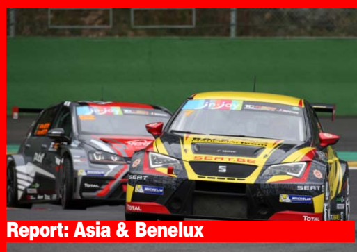
Report: Asia & Benelux