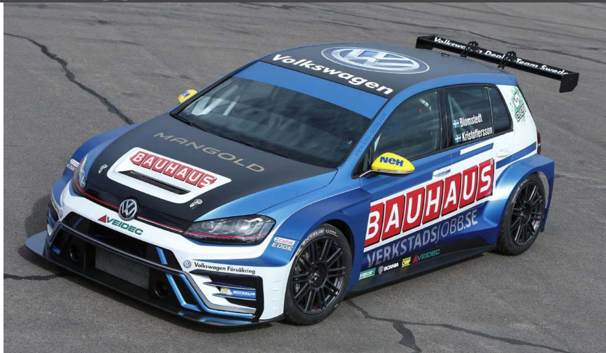
The Kristoffersson Motorsport Volkswagen Golf Ti