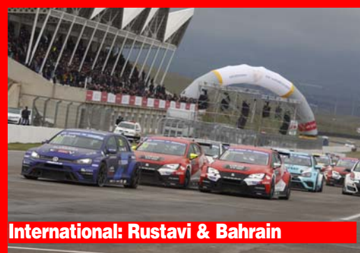
International: Rustavi & Bahrain