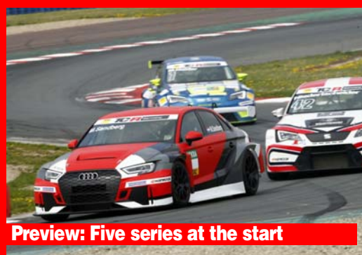
Preview: Five series at the start