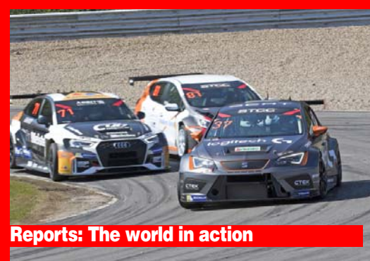
Reports: The world in action