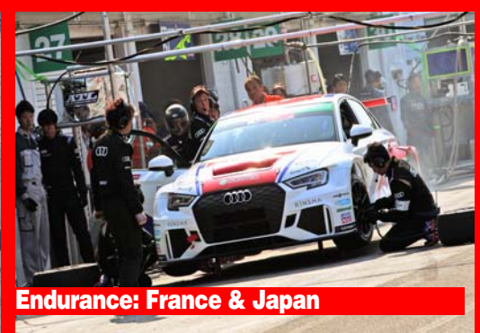
Endurance: France & Japan