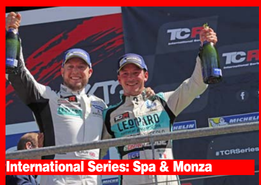
International Series: Spa & Monza