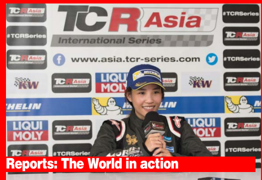
International Series: Five for the title